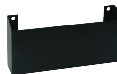
Wall holder for loop amplifier