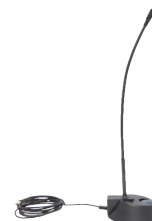
M-2 goose neck microphone